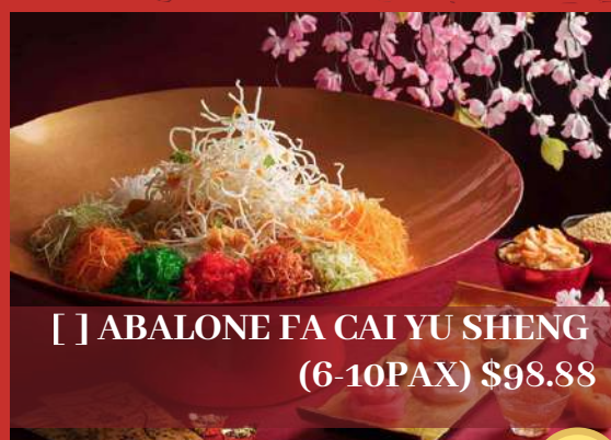
ABALONE FA CAI YU SHENG (6-10PAX) $98.88

SINGAPORE'S OLDEST NONYA RESTAURANT (1953)