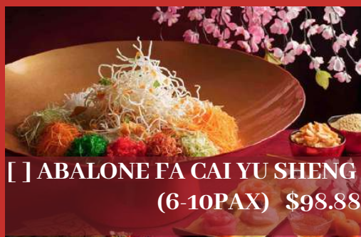
[ ] ABALONE FA CAI YU SHENG (6-10PAX) $98.88

Price Per Person - Subject to Prevailing GST