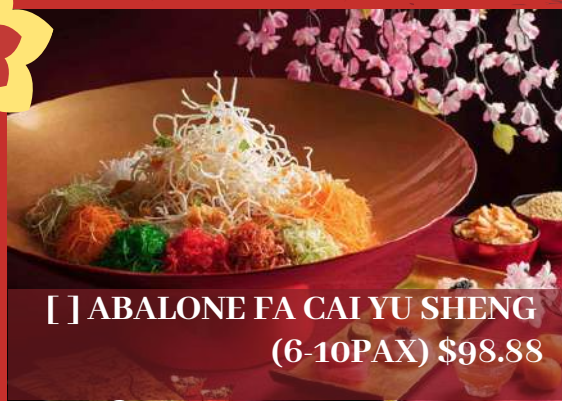
ABALONE FA CAI YU SHENG (6-10PAX) $98.88